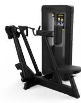
SEATED ROW ES817

PRODUCT DIMENSIONS 33.4 x 45.3 x 57.8 in (84.8 x 115 x 146.8 cm) WEIGHT STACK 205 lbs (92.9 kg)