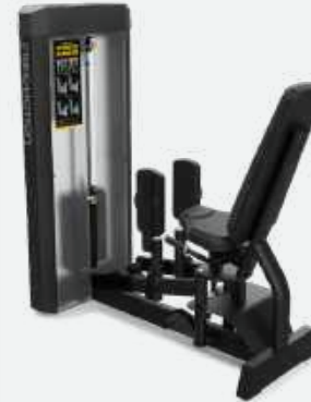
HIP ADDUCTION/ABDUCTION ES809

PRODUCT DIMENSIONS 61.4 x 64.1 x 57.8 in (155.9 x 155.1 x 146.8 cm) WEIGHT STACK 205 lbs (92.9 kg)