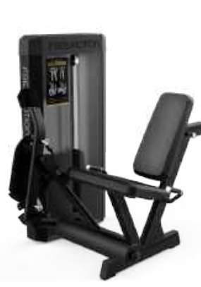
LEG EXTENSION ES801

PRODUCT DIMENSIONS 61.7 x 42 x 72 in (156.7 x 106.6 x 182.8 cm) WEIGHT STACK 295 lbs (133.8 kg)