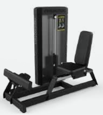
CALF EXTENSION ES813

PRODUCT DIMENSIONS 48.3 x 62.1 x 99.6 in (122.6 x 157.7 x 252.9 cm) WEIGHT STACK 225 lbs (102 kg)