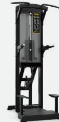
DIP CHIN ASSIST ES812

PRODUCT DIMENSIONS 40.5 x 50.6 x 57.8 in (102.8 x 128.5 x 146.8 cm) WEIGHT STACK 205 lbs (92.9 kg)