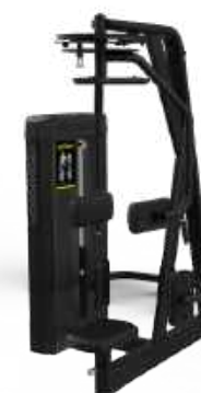
TORSO ROTATION ES818

PRODUCT DIMENSIONS 39.7 x 69 x 57.8 in (100.8 x 175.2 x 146.8 cm) WEIGHT STACK 255 lbs (115.6 kg)