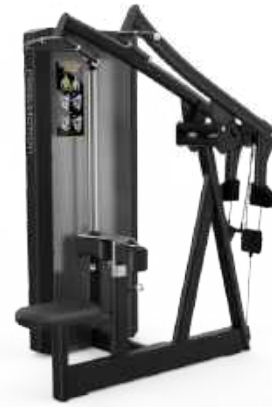
LAT PULLDOWN/HIGH ROW ES802

PRODUCT DIMENSIONS 51.3 x 54 x 57.8 in (130.3 x 137.1 x 146.8 cm) WEIGHT STACK 285 lbs (129.2 kg)