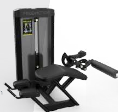
PRONE LEG CURL ES814

PRODUCT DIMENSIONS 68.9 x 43.3 x 57.8 in (175 x 190.9 x 146.8 cm) WEIGHT STACK 375 lbs (170 kg)