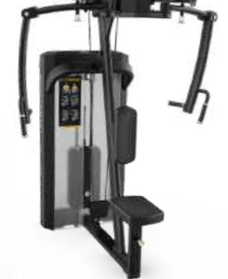
PEC FLY/REAR DELT ES806

PRODUCT DIMENSIONS 90.6 x 44.1 x 72.8 in (230.1 x 112 x 184.9 cm) WEIGHT STACK 475 lbs (215.4 kg)