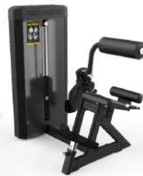
BACK EXTENSION ES815

PRODUCT DIMENSIONS 53.4 x 66.4 x 57.8 in (135.6 x 168.6 x 146.8 cm) WEIGHT STACK 195 lbs (88.4 kg)