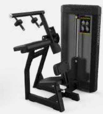
TRICEPS EXTENSION ES811

PRODUCT DIMENSIONS 40.5 x 50 x 57.8 in (102.8 x 127 x 146.8 cm) WEIGHT STACK 205 lbs (92.9 kg)