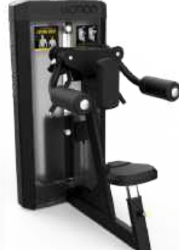
LATERAL RAISE ES816

PRODUCT DIMENSIONS 39 x 53.4 x 57.8 in (99 x 135.6 x 146.8 cm) WEIGHT STACK 265 lbs (120.2 kg)