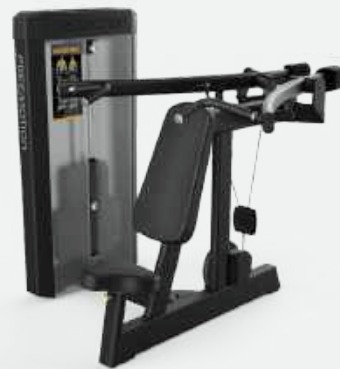
SHOULDER PRESS ES807

PRODUCT DIMENSIONS 33.3 x 53.5 x 76.2 in (84.5 x 135.8 x 193.5 cm) WEIGHT STACK 195 lbs (88.4 kg)