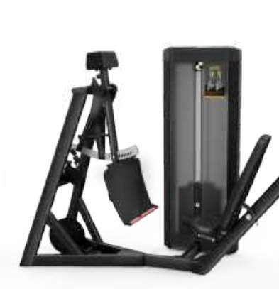
LEG PRESS ES804

PRODUCT DIMENSIONS 448.9 x 59 x 57.8 in (124.2 x 149.8 x 146.8 cm) WEIGHT STACK 205 lbs (92.9 kg)