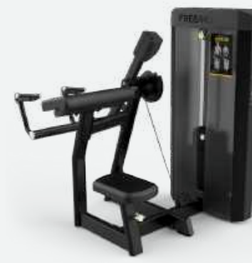
BICEPS CURL ES810

PRODUCT DIMENSIONS 62.5 x 28.5 x 58 in (158.7 x 72.3 x 147.3 cm) WEIGHT STACK 155 lbs (70.3 kg)