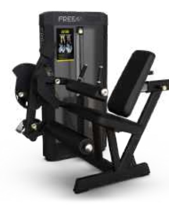
LEG CURL ES803

PRODUCT DIMENSIONS 51.8 x 66.5 x 76.8 in (131.5 x 168.9 x 195 cm) WEIGHT STACK 305 lbs (138.3 kg)