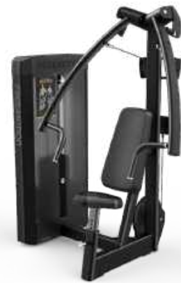
CHEST PRESS ES800

Features a clean, modern design complete with an accessories holder in the top cap.