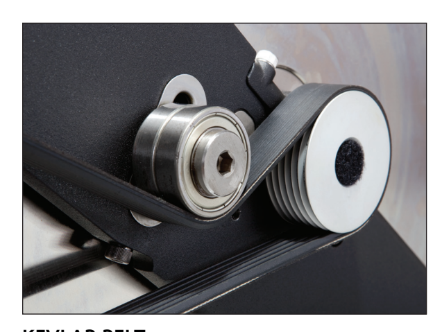
KEVLAR BELT Automotive-grade belt results in a smooth, quiet ride. Delivers long life and maintenance-free operation.