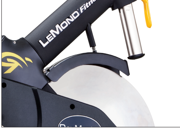
IMPROVED CORROSION RESISTANCE Finished and tested to high standards under extreme conditions.