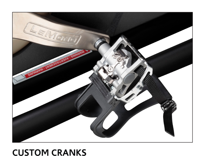
Forged crank and two-piece bottom bracket are designed to handle the demands of high-use applications.