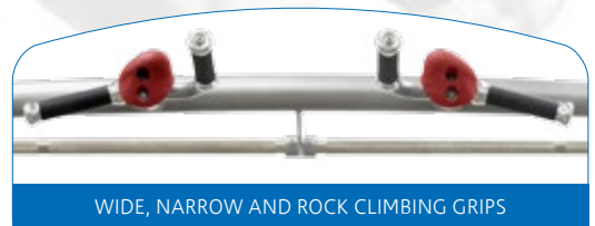
WIDE, NARROW AND ROCK CLIMBING GRIPS