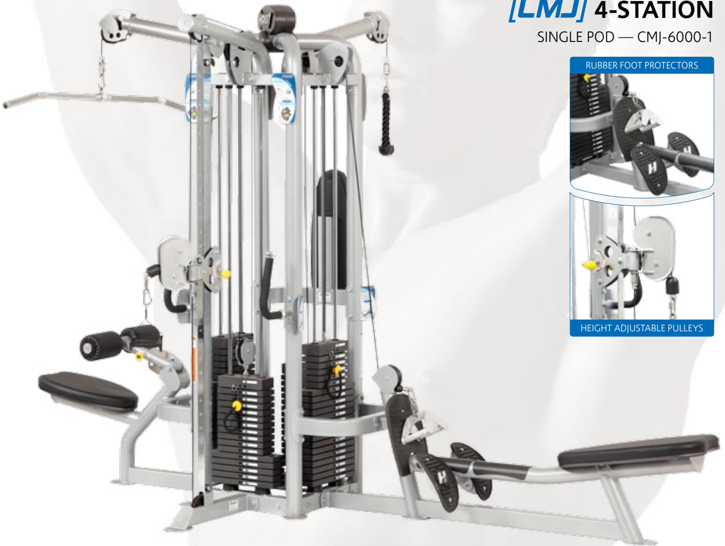
RUBBER FOOT PROTECTORS